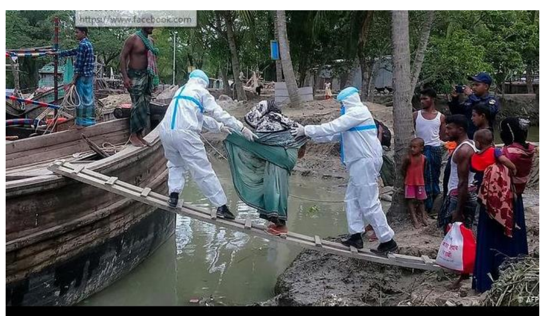
cyclones, typhoons, hurricanes - the power of devastation Social distancing impossible during Cyclone Amphan

Many people refused to go to shelters or leave their livestock, as they were afraid of contracting COVID-19.